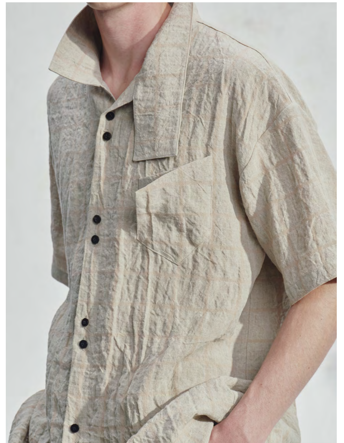
SUNBLEACHED CHECK ASYMMETRIC HIGH-NECK SHORT-SLEEVE SHIRT 1S0500260102 SUNBLEACHED CHECK CASUAL CROPPED PANTS 1T0500260201