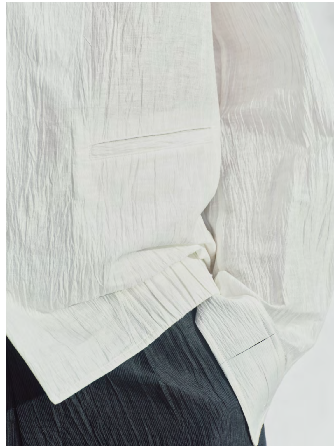
WHITE DARTED STAND-COLLAR SHIRT 1S0400260101 BLACK COTTON-LINEN FLAP-POCKET SHORTS 1T0300260102