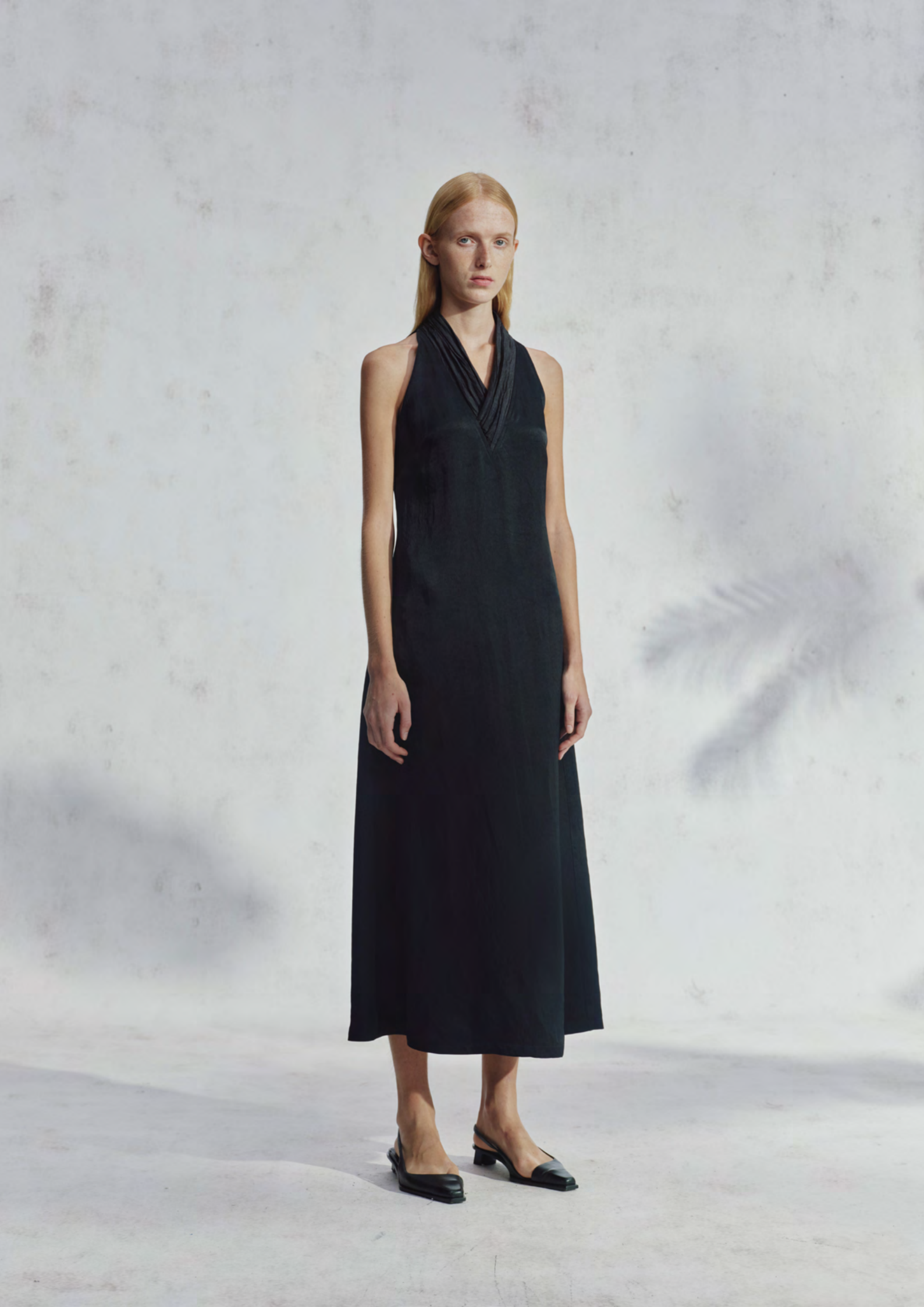
BLACK GATHERED V-NECK DRESS OD0100260101