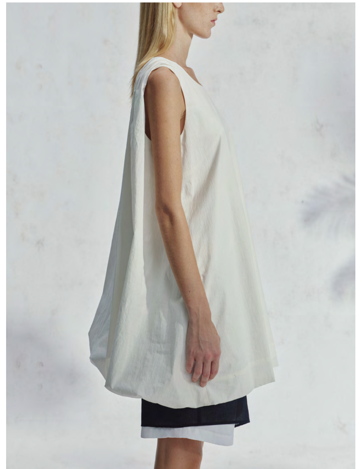
WHITE GATHERED BALLOON DRESS 0D0500260102 BLACK AND WHITE DOUBLE-LAYER TROUSERS 0T0500260101