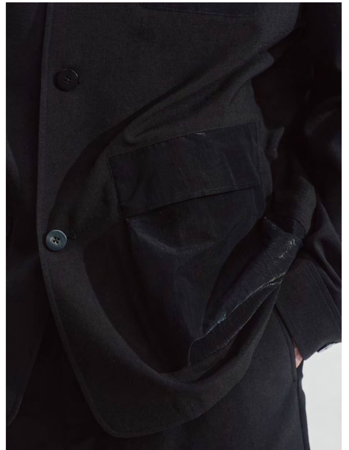
BLACK LAYERED-LOOK WORKWEAR JACKET 1C0100260101 BLACK FLAP PATCH-POCKET SHORTS 1T0300260101