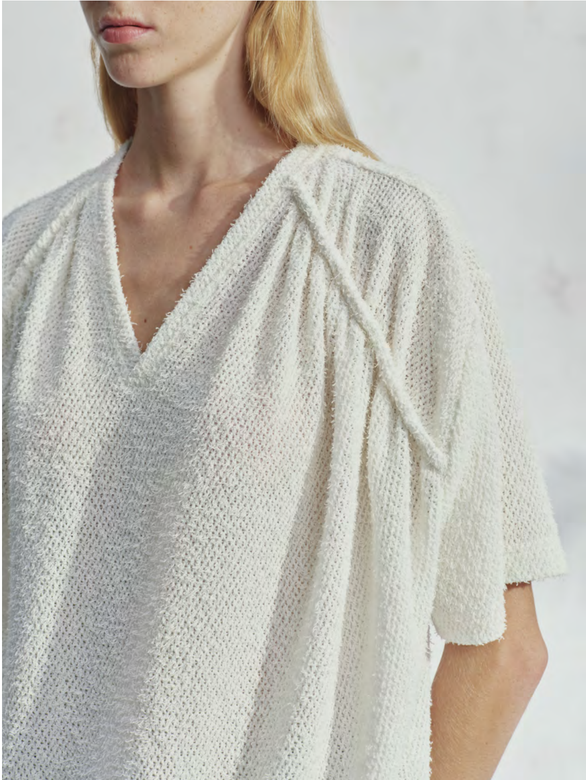
WHITE RUCHED V-NECK MESH-KNIT T-SHIRT OTS0100260101 VEIL MOSSSTRIPE TRIPLE-SLIT SKIRT OSK0200260102