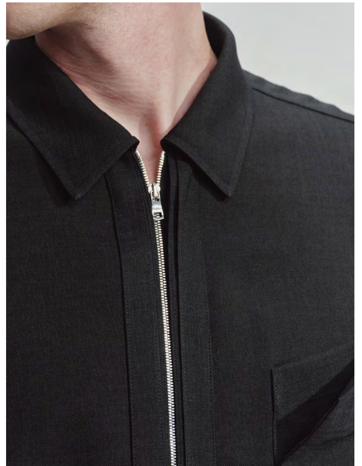
BLACK DOUBLE LAYER ZIP SHIRT 1S0200260101 WHITE CASUAL CROPPED PANTS 1T0500260202