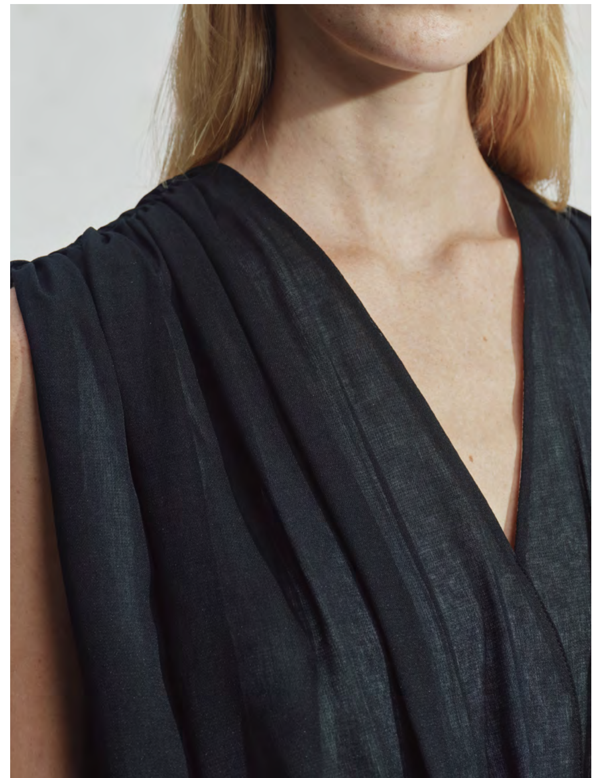
BLACK AND WHITE DOUBLE-LAYER PLEATED TOP OTP0200260101 BLACK WOOL-ACETATE PANELLED STRAIGHT-LEG PANTS OT0300260101