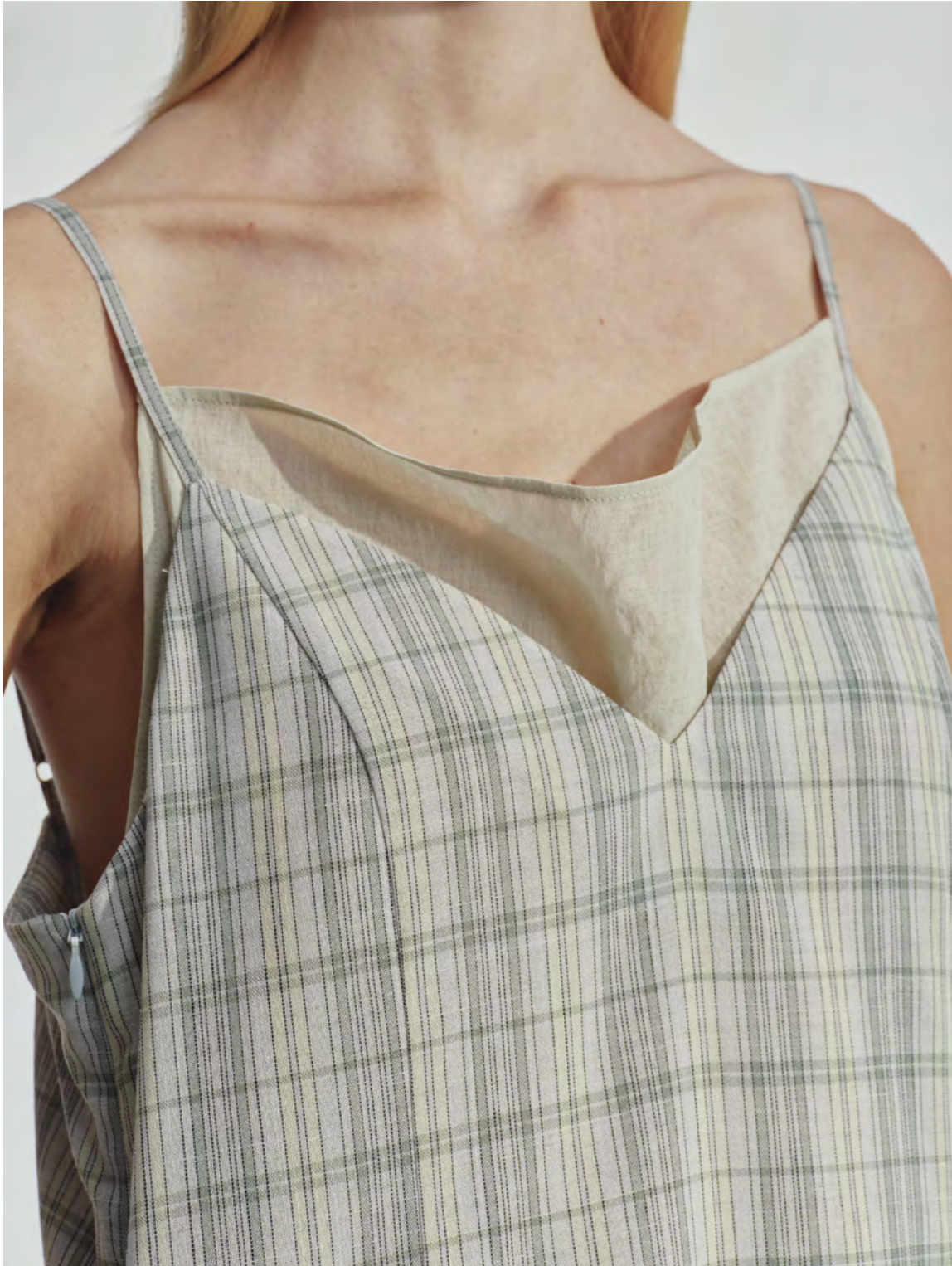
VEIL MOSSSTRIPE DOUBLE-LAYERED SLIP DRESS 0D0400260102