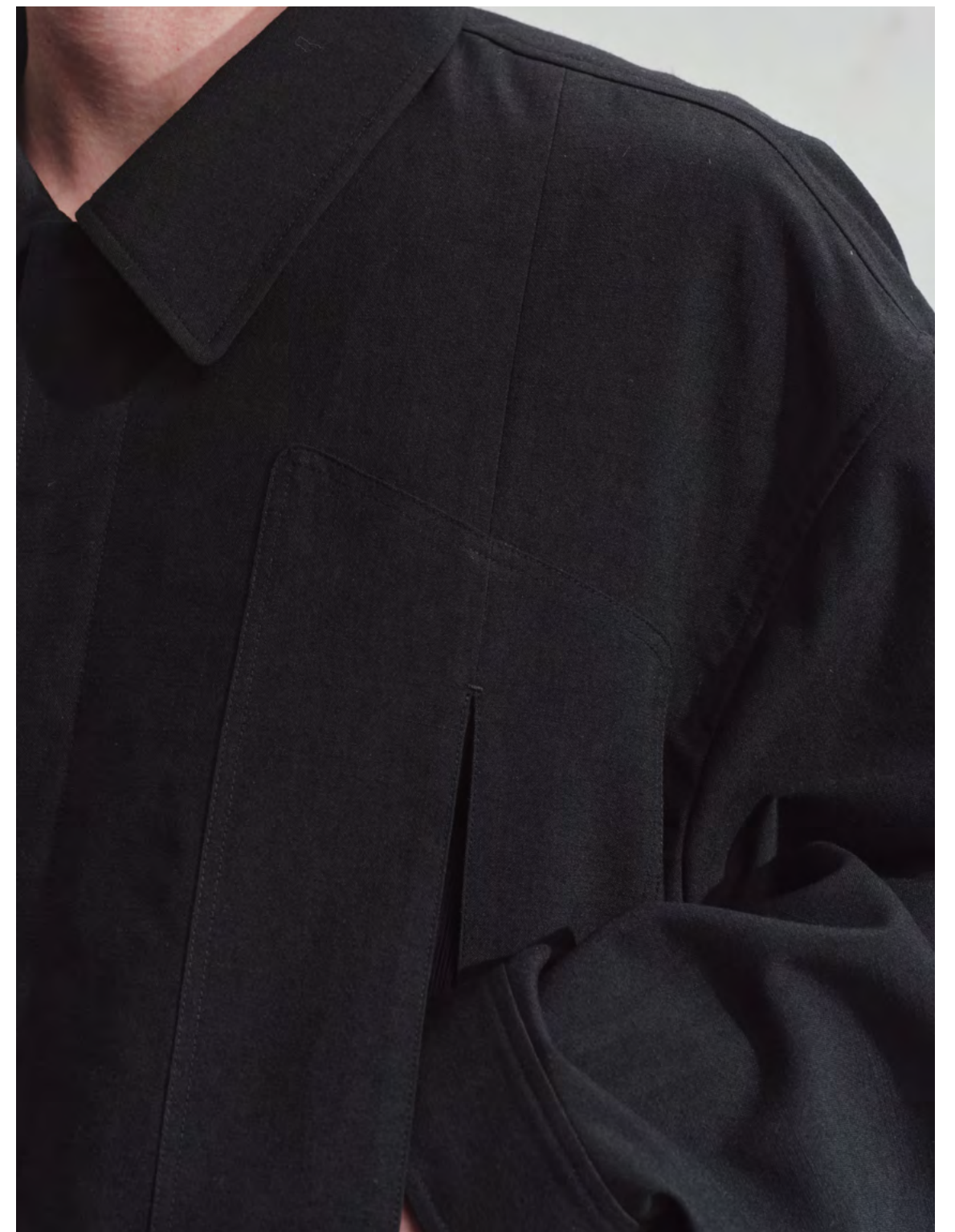
BLACK PANELED SLIT JACKET 1J0200260101 WHITE COTTON FLAP-POCKET SHORTS 1T0300260103