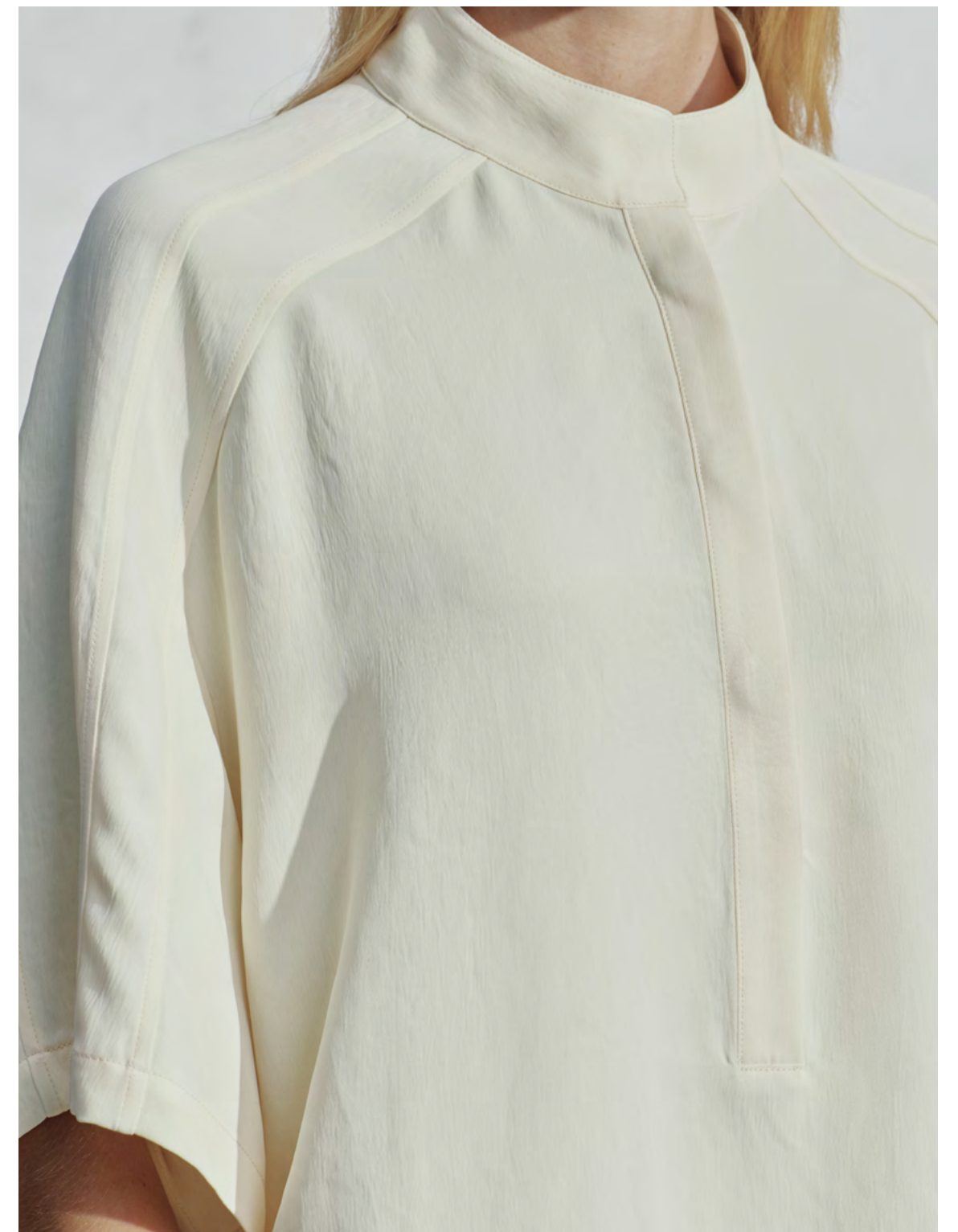
MUTED CREAM STAND COLLAR RAGLAN SLEEVE SHIRT OS0100260101 MUTED CREAM DRAWSTRING WIDE-LEG PANTS OT0400260101