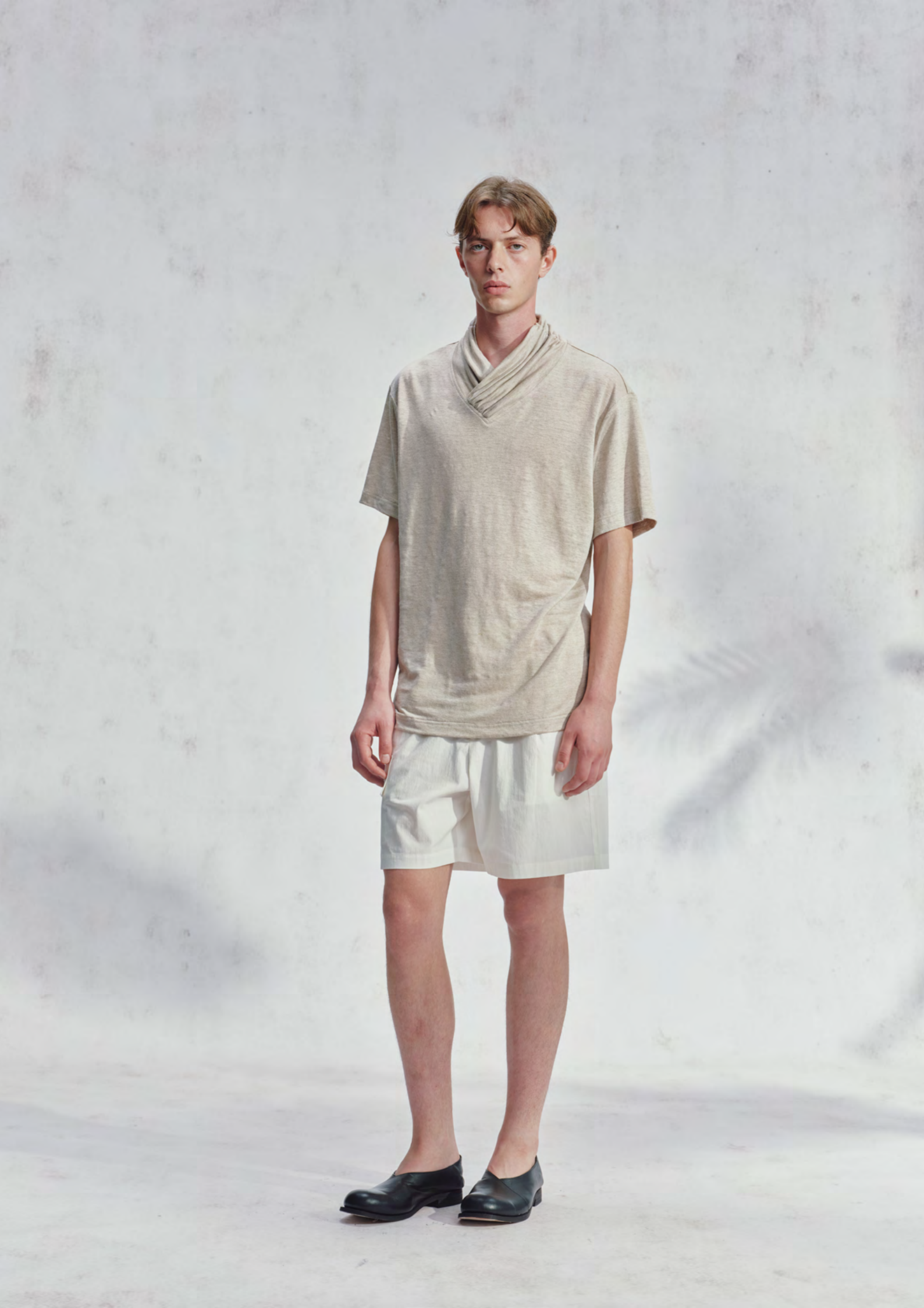
HEATHERED OATMEAL SCARVED COLLAR SHORT SLEEVE T-SHIRT 1TS0500260102 WHITE COTTON FLAP-POCKET SHORTS 1T0300260103