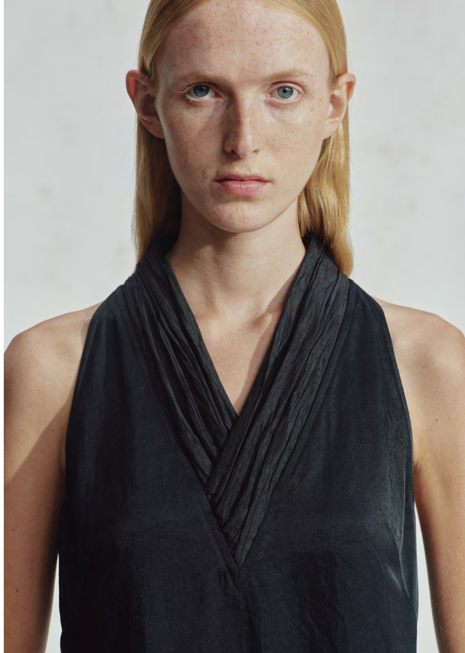
BLACK GATHERED V-NECK DRESS OD0100260101