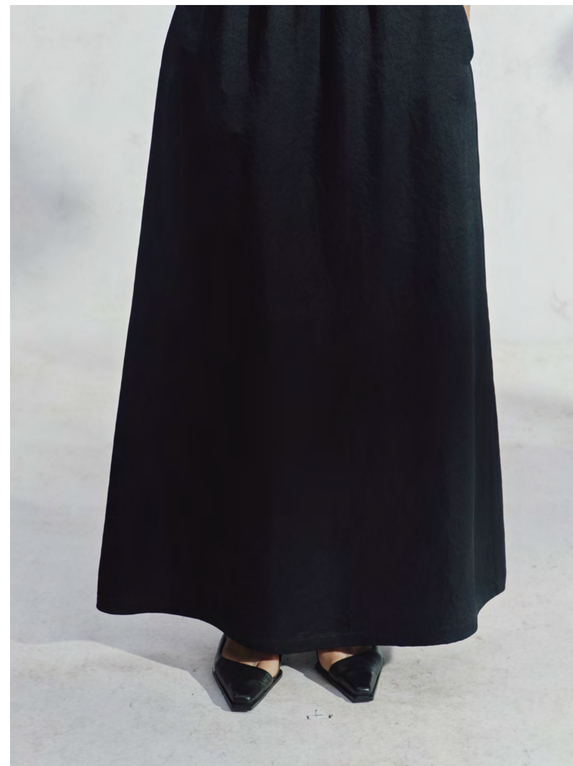
WHITE GATHERED V-NECK TOP OTP0500260101 BLACK ELASTIC-WAIST MAXI SKIRT OSK0300260101