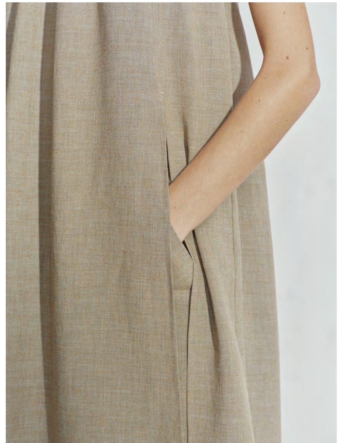
LAKE-TONED BROWN SLIT DETAIL STRAPLESS DRESS 0D0200260102