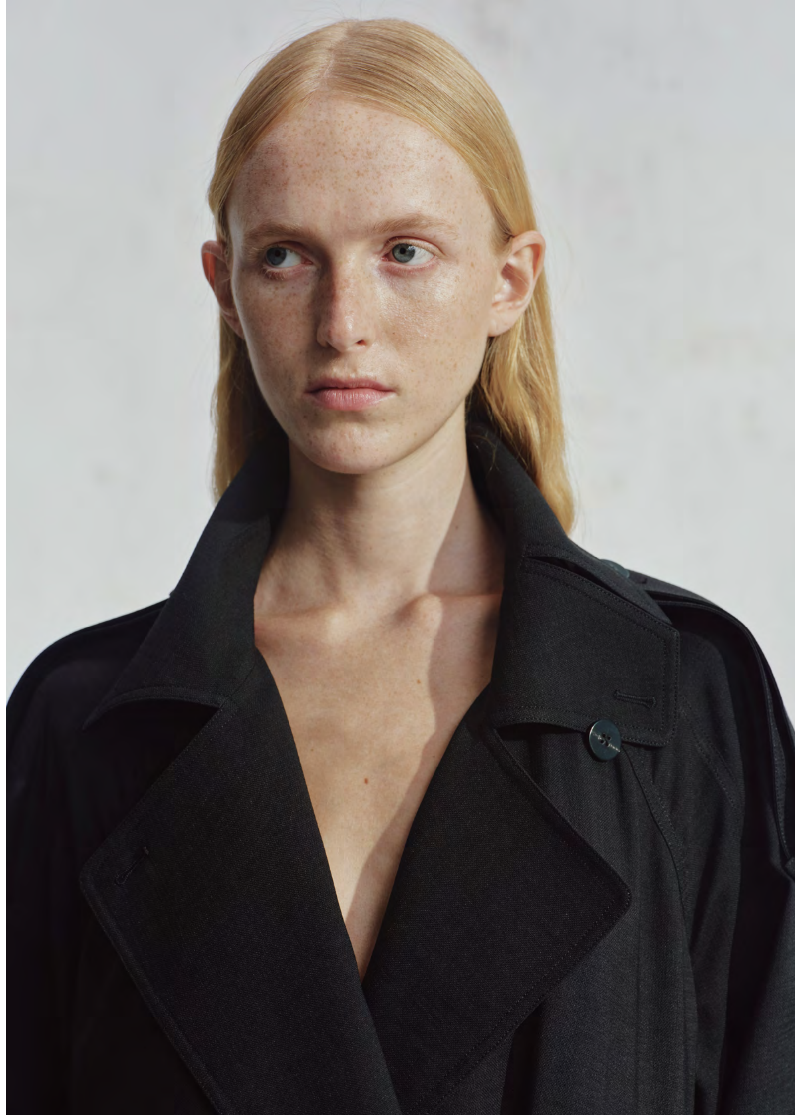
BLACK PANELED COLLAR TRENCH COAT OC0100260101