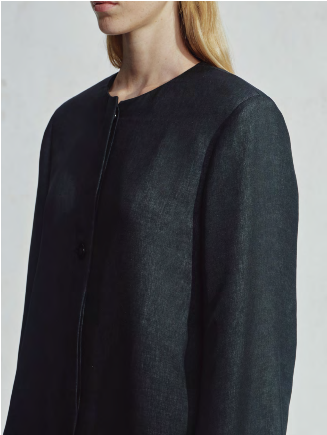
BLACK AND WHITE DOUBLE-LAYER COLLARLESS JACKET OJ0200260101 BLACK WOOL-ACETATE PANELLED STRAIGHT-LEG PANTS OT0300260101