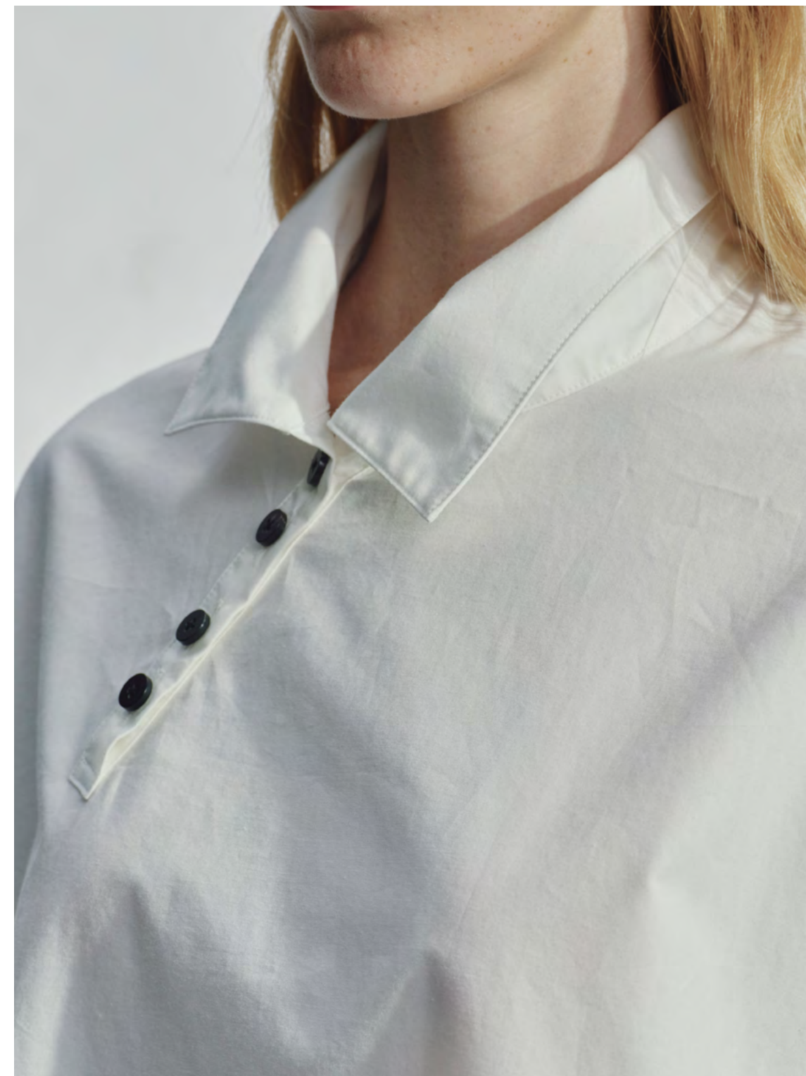
WHITE LOOSE SHIRT WITH DIAGONAL FRONT OS0200260101 BLACK WOOL-ACETATE PANELLED STRAIGHT-LEG PANTS OT0300260101