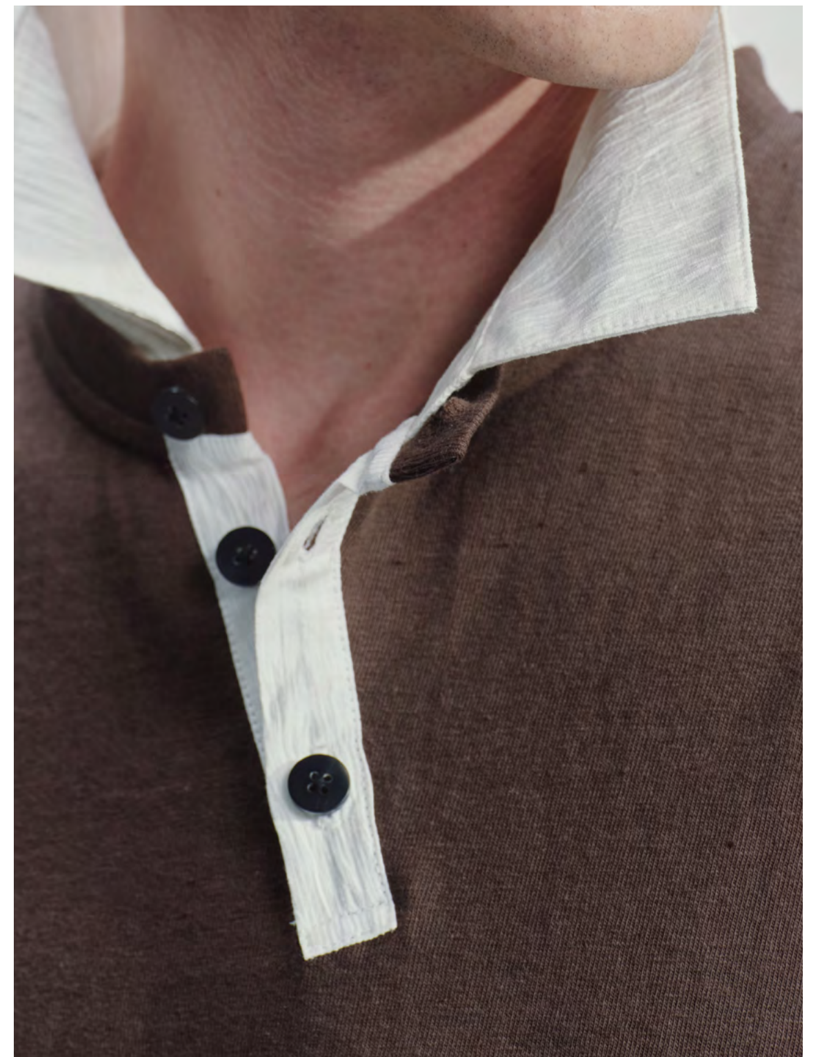
COFFEE SHIRT COLLAR T-SHIRT 1TS0200260101 WHITE CASUAL CROPPED PANTS 1T0500260202