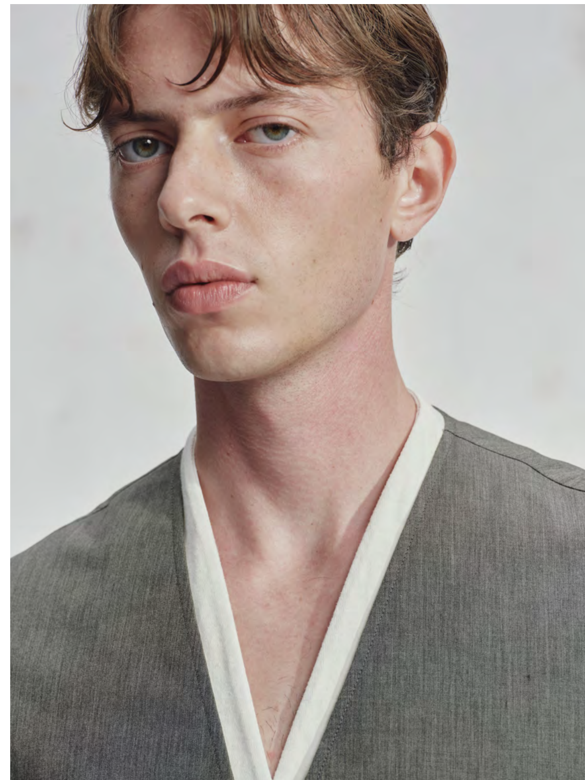
ASH BROWN DOUBLE-LAYER TAILORED VEST 1V0100260101 ASH BROWN DRAWSTRING STRAIGHT-LEG PANTS 1T0400260101