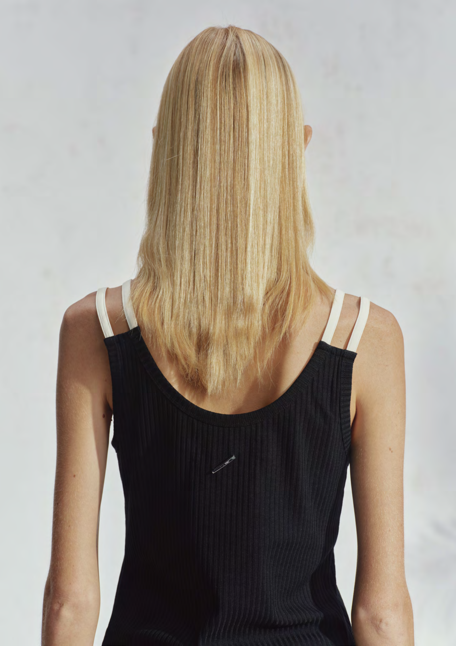
BLACK DOUBLE CAMISOLE TANK TOP OTT0100260102