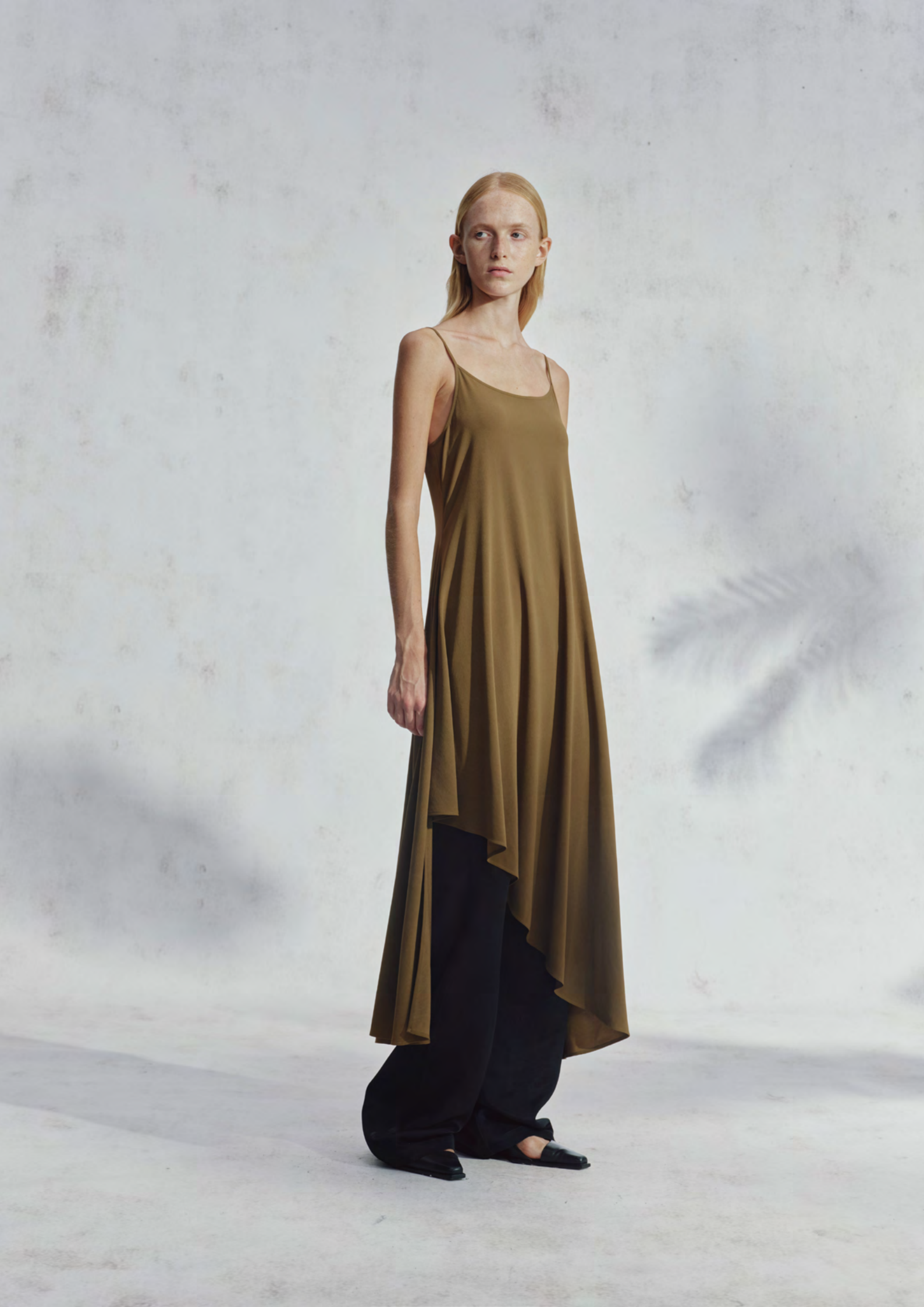
DRY SAGE TAN TIERED-HEM SLIP DRESS 0D0300260101