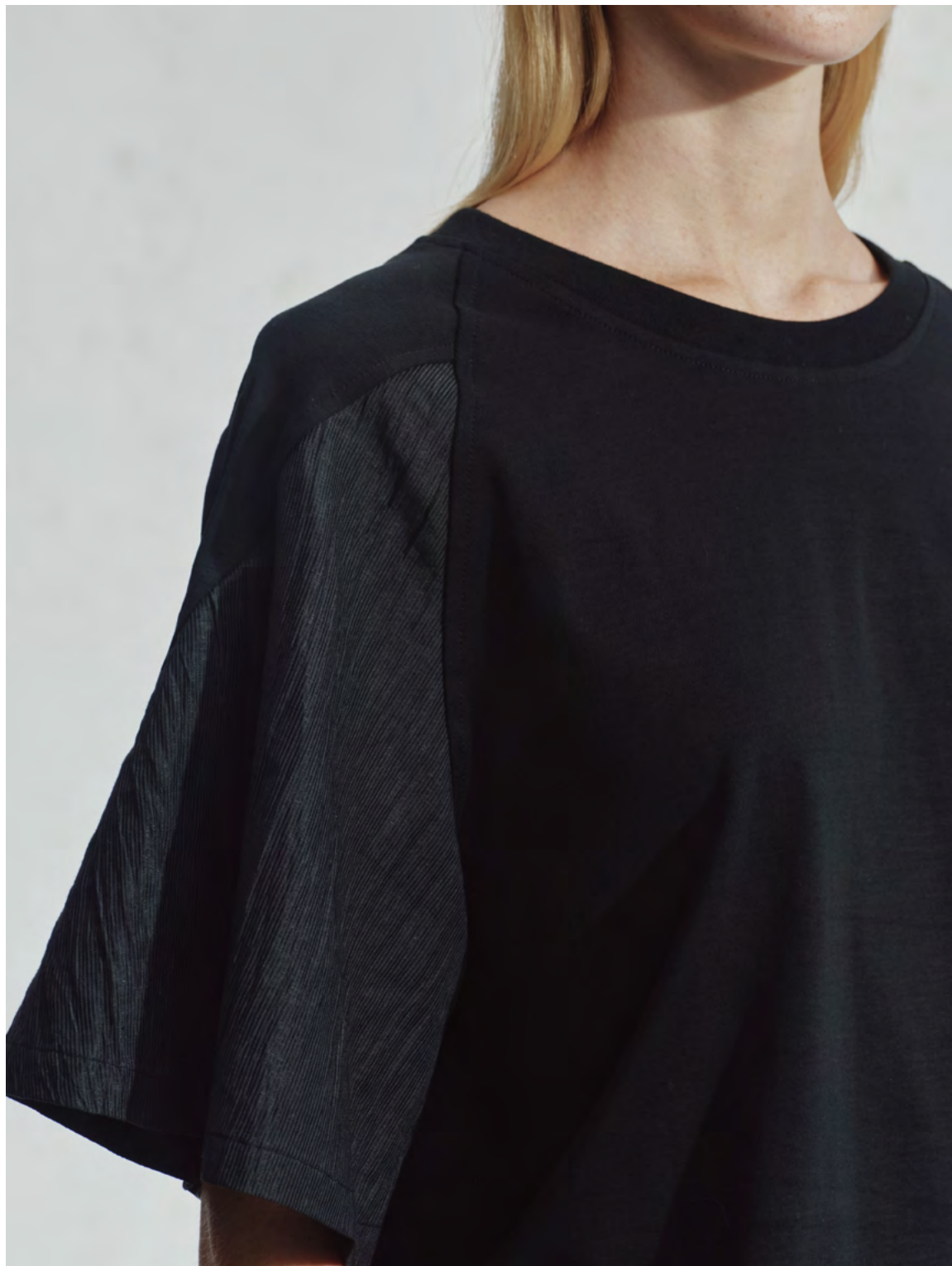
BLACK PANELLED-SLEEVE T-SHIRT 0TS0300260102 BLACK ELASTIC-WAIST MAXI SKIRT 0SK0300260101