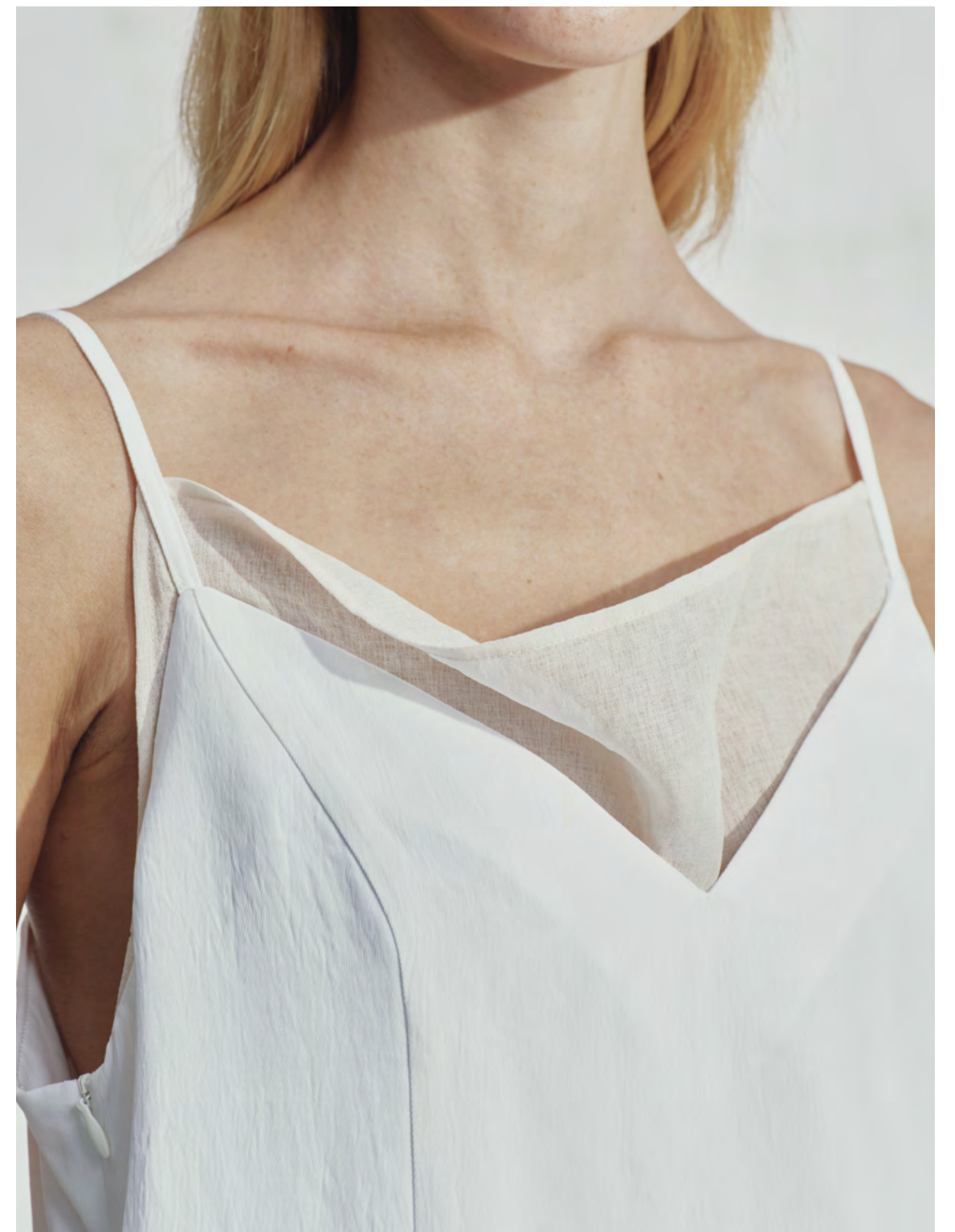
WHITE DOUBLE-LAYERED SLIP DRESS 0D0400260101