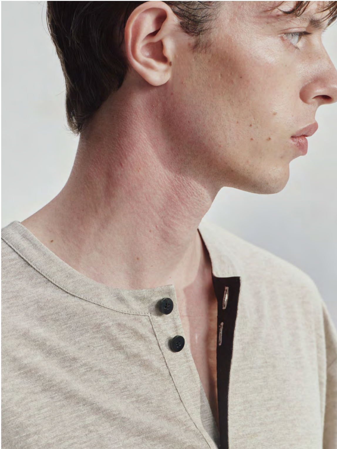
HEATHERED OATMEAL EXTENDED PLACKET HENLEY T-SHIRT 1TS0100260101 SUNBLEACHED CHECK CASUAL CROPPED PANTS 1T0500260201