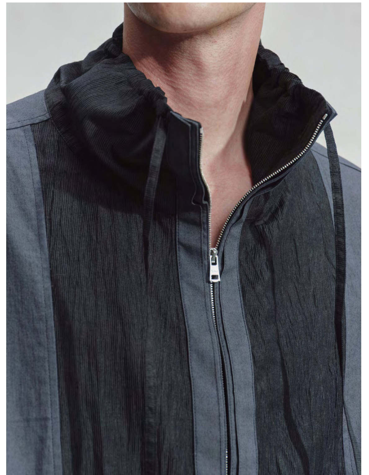
PAYNE'S GREY STAND-COLLAR DRAWSTRING JACKET 1J0500260101 PAYNE'S GREY DRAWSTRING STRAIGHT-LEG PANTS 1T0400260103