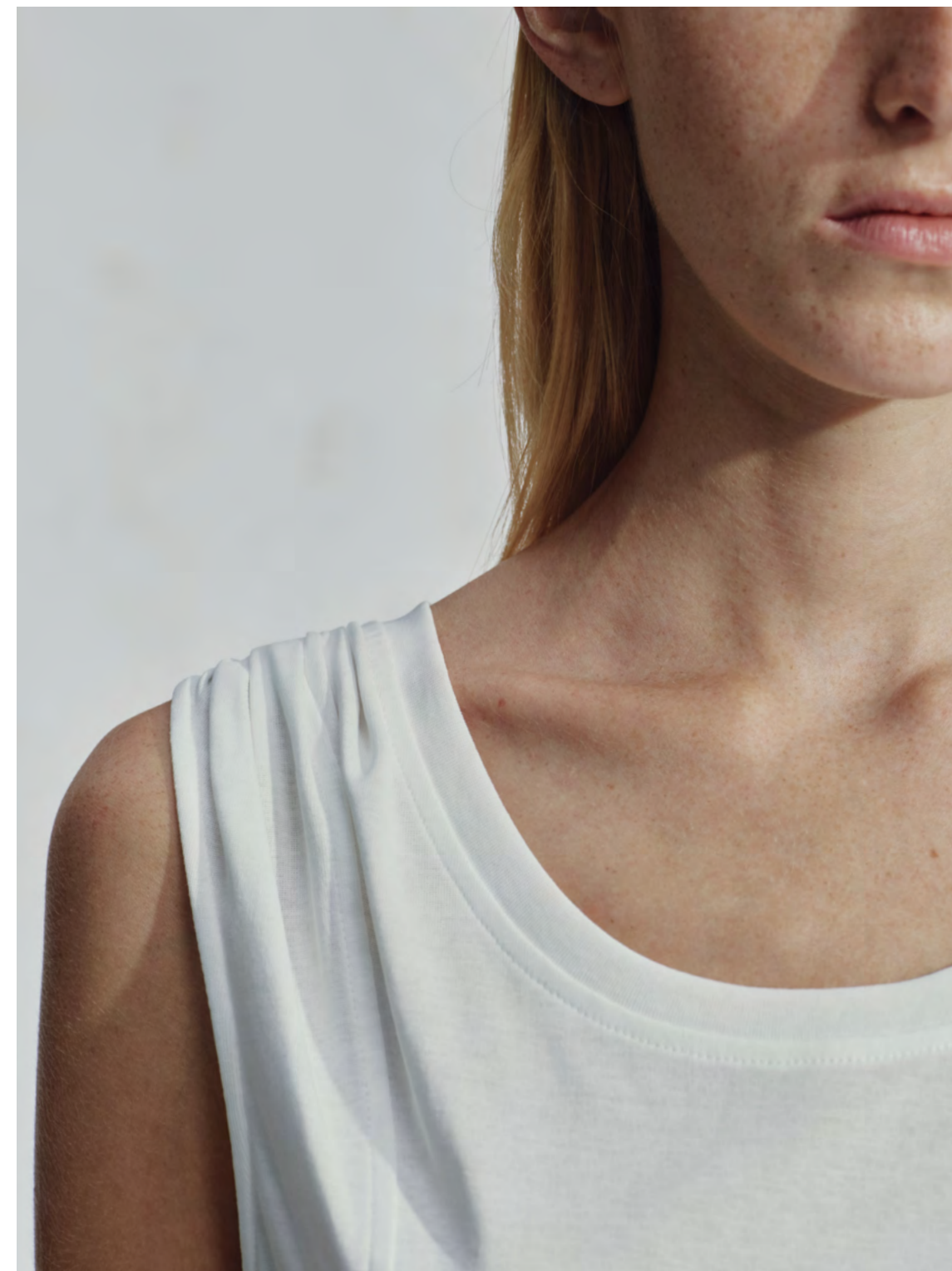
WHITE GATHERED-SHOULDER TANK TOP 0TT0200260102 BLACK WOOL-ACETATE PANELLED STRAIGHT-LEG PANTS 0T0300260101