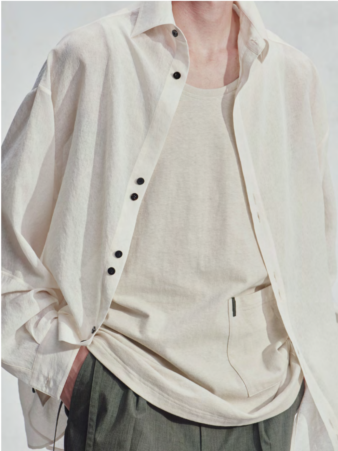
MIST BEIGE SHEER RELAXED DRAPED-COLLAR SHIRT 1S0100260101 BEIGE PATCH-POCKET TANK TOP 1TT0100260101 ASH BROWN DRAWSTRING STRAIGHT-LEG PANTS 1T0400260101