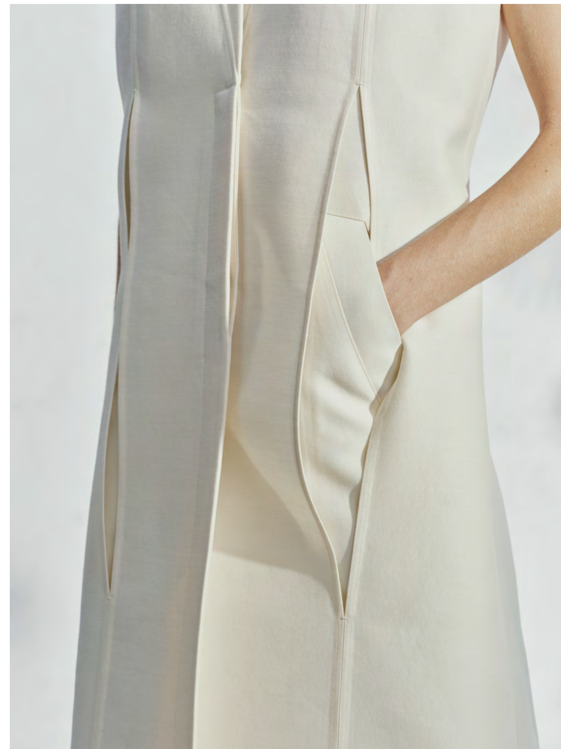
WHITE SLIT-DETAIL SLEEVELESS BLAZER OV0100260101 BLACK WOOL-ACETATE PANELLED STRAIGHT-LEG PANTS OT0300260101