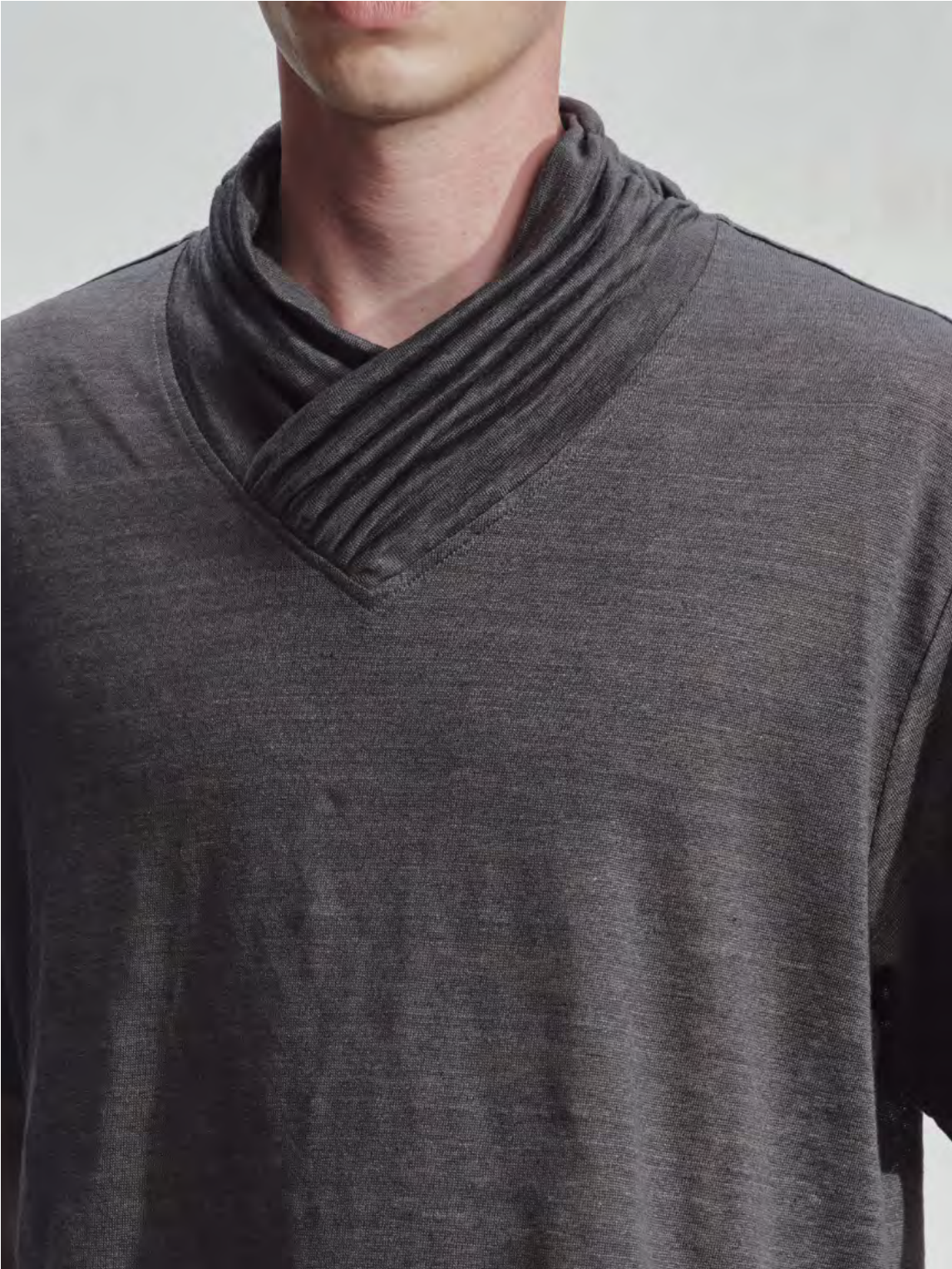
HEATHERED DARK GREY SCARVED COLLAR SHORT SLEEVE T-SHIRT 1TS0500260101 PAYNE'S GREY RELAXED FIT CARGO SHORTS 1T0100260102