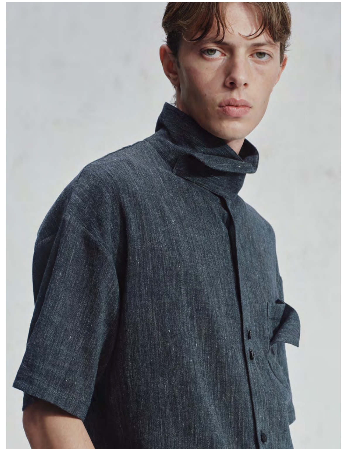
DUSTY NAVY ASYMMETRIC HIGH-NECK SHORT-SLEEVE SHIRT 1S0500260103 DUSTY NAVY RELAXED FIT CARGO SHORTS 1T0100260101