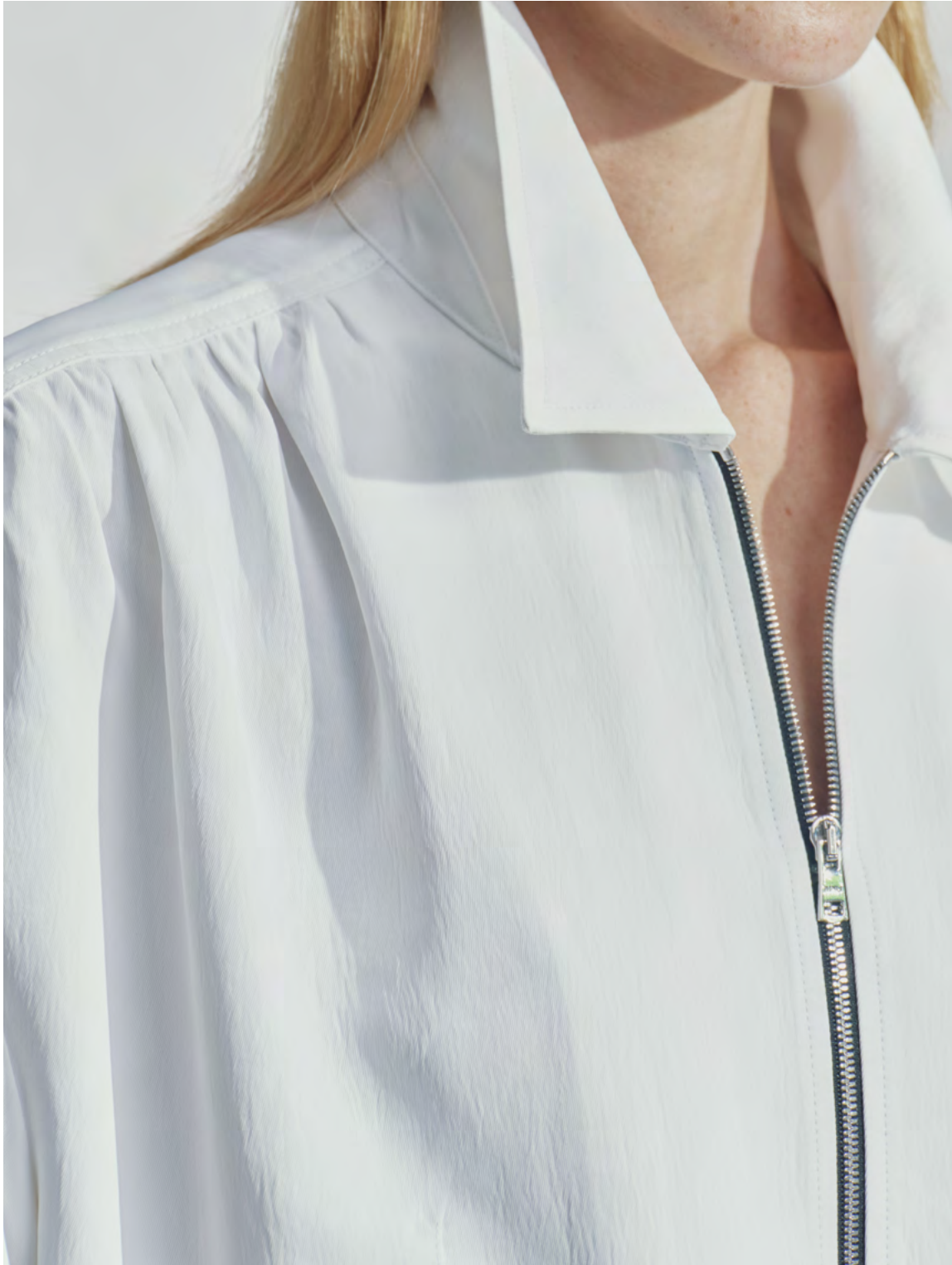
WHITE RUCHED ZIP JACKET OJ0300260101 BLACK FLARED CULOTTES OT0100260101