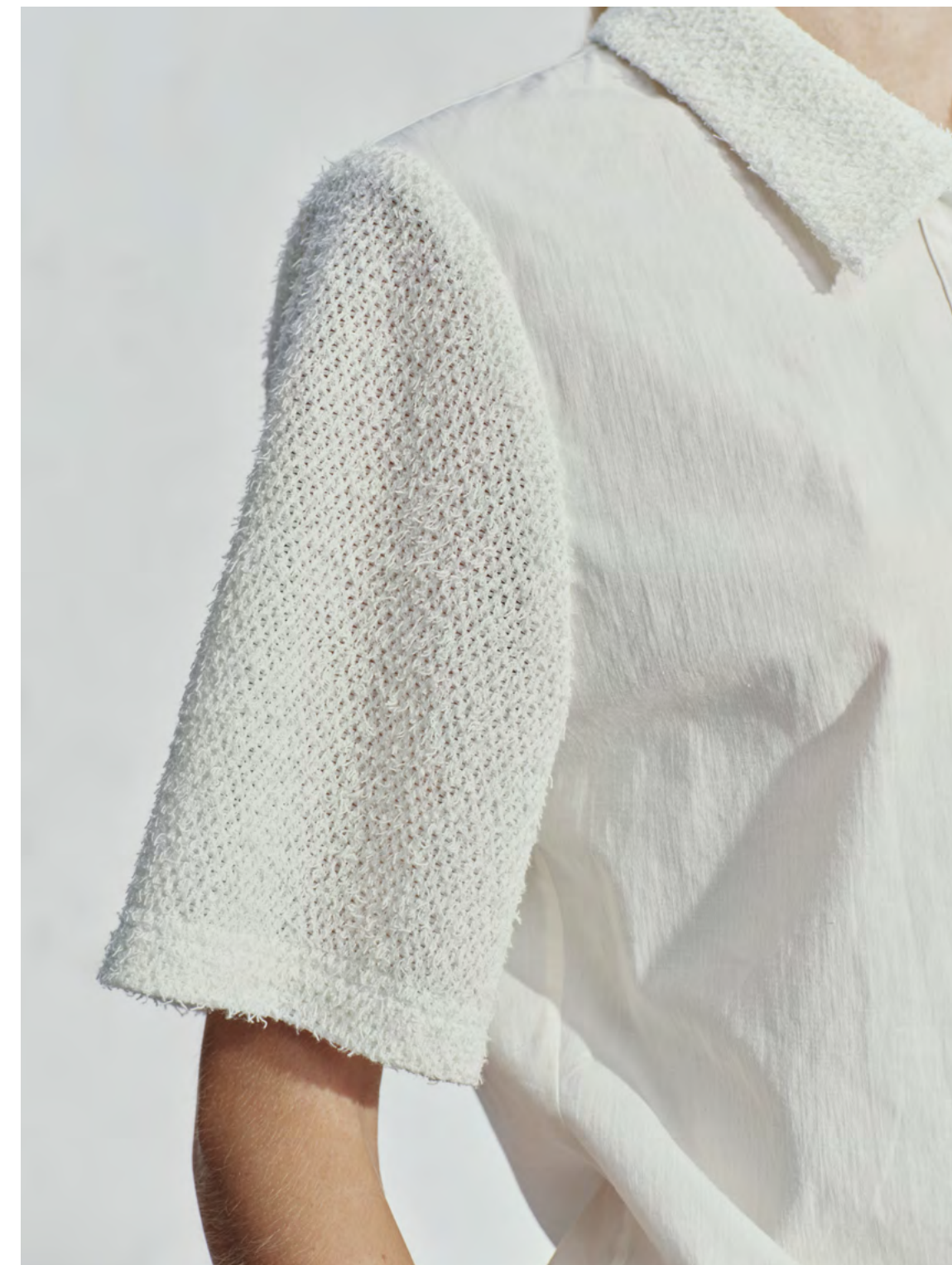
WHITE ZIP-FRONT MESH-PANEL SHIRT OS0400260101 BLACK AND WHITE DOUBLE-LAYER TROUSERS OT0500260101