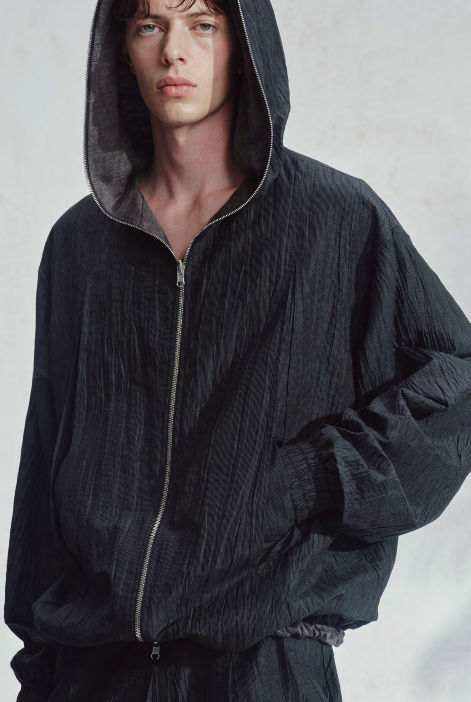
BLACK COTTON-LINEN REVERSIBLE SLIT ZIP HOODIE 1H0100260101