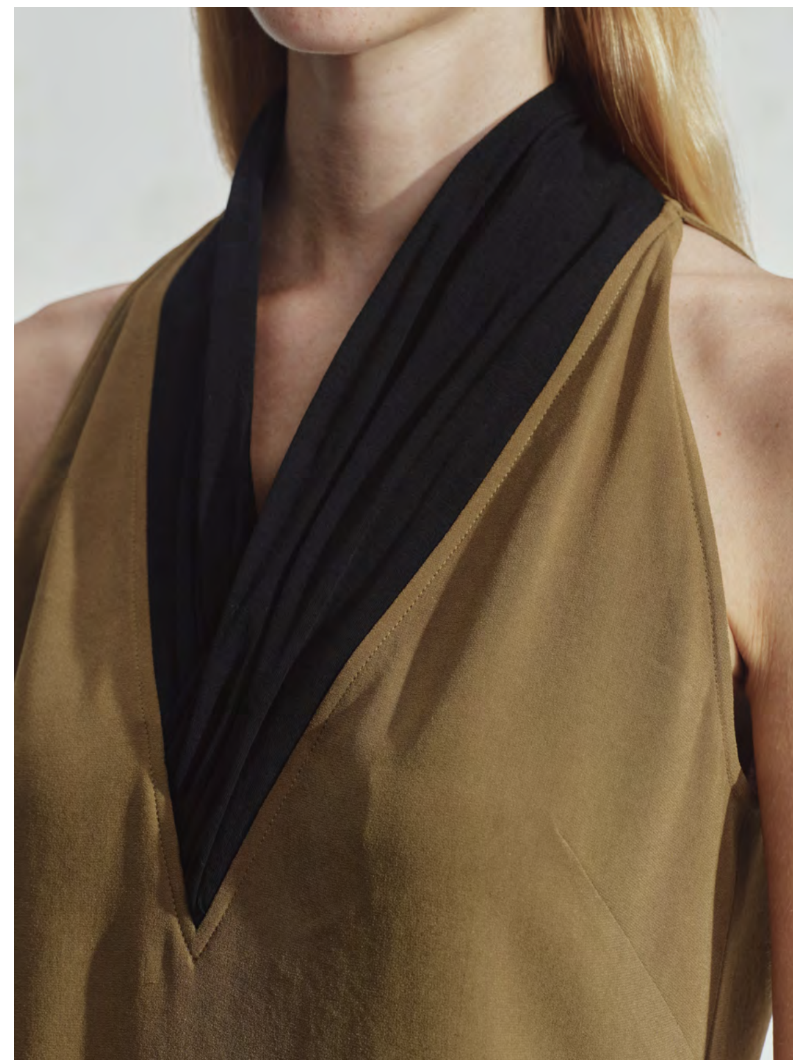
DRY SAGE TAN GATHERED V-NECK TOP 0TP0500260201 DRY SAGE TAN LACE-UP MAXI SKIRT 0SK0100260101