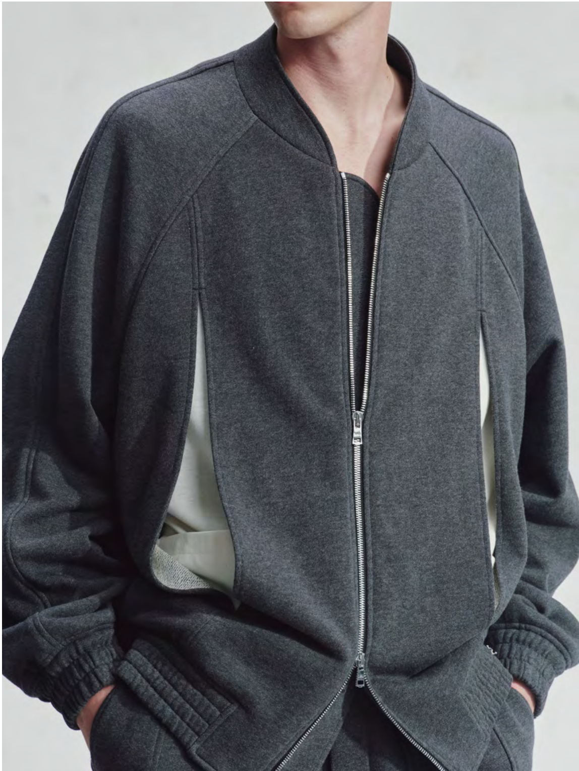
DARK GREY RAGLAN-SLEEVE SLIT BOMBER JACKET 1J0300260201 DARK GREY ELASTICIZED PATCHWORK SHORTS 1T0600260101