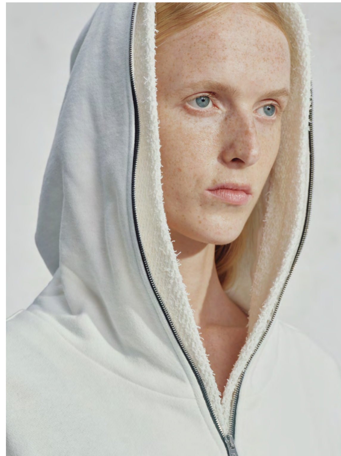
WHITE MINI DOUBLE-PLACKET HOODIE OH0100260101 WHITE JERSEY FLARED CULOTTES OT0100260102