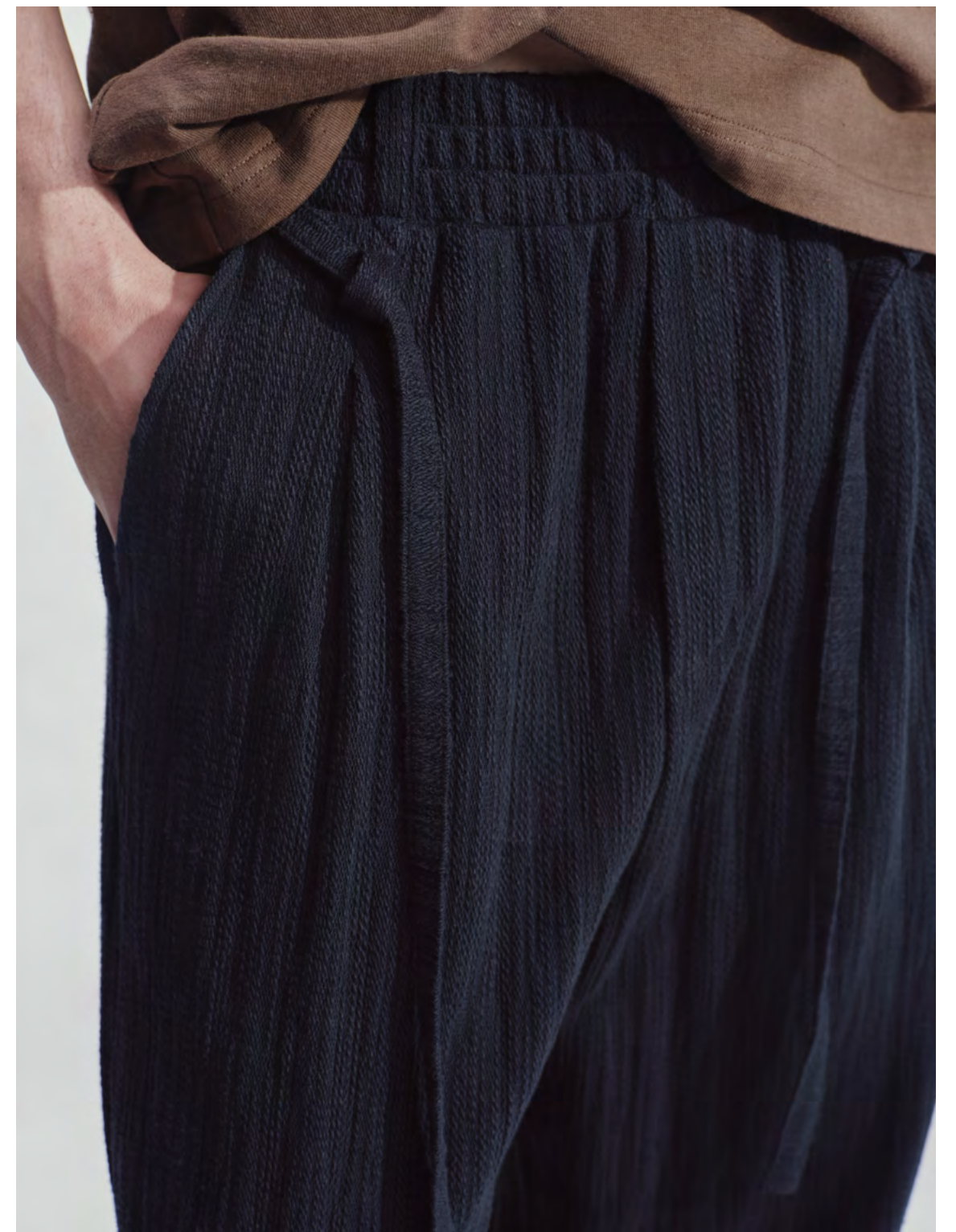
COFFEE PATCH-POCKET SHORT-SLEEVE T-SHIRT 1TS0300260101 NAVY BELTED CROPPED PANTS 1T0200260101