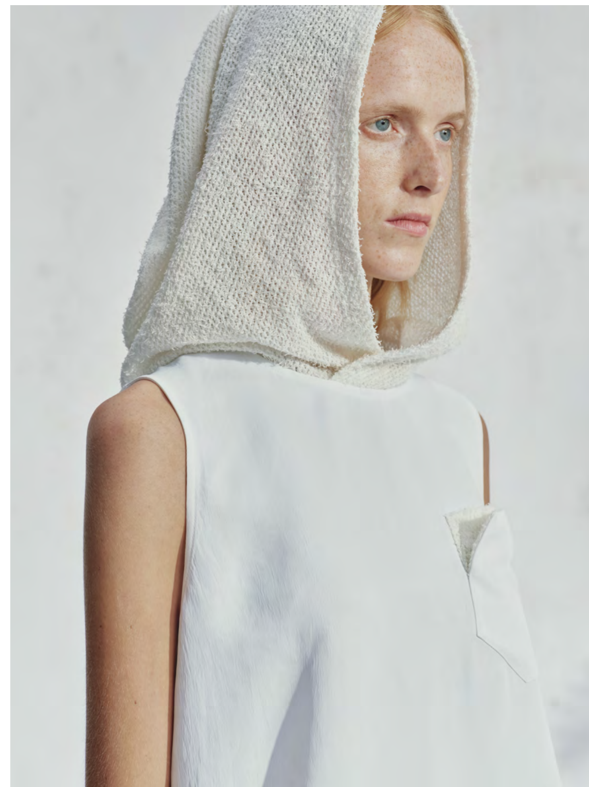
WHITE RUCHED HOOD SLEEVELESS TOP OTP0100260101 BLACK ELASTIC-WAIST MAXI SKIRT OSK0300260101